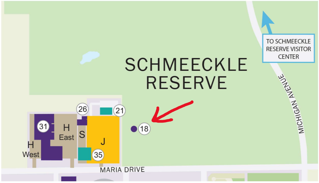
Figure 2. Map of Schmeeckle showing the meeting location at Schmeeckle pavilion, labeled number 18.